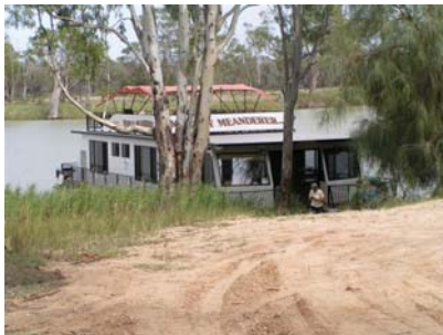
Parked while we take our daily exercise

Looking for a holiday that's relaxing, value-for-money and great fun. Arguably the best place to take a houseboat holiday is in South Australia. The scenery is diverse and spectacular, ranging from red-ochre cliffs and towering gum trees, to sandy beaches and lush orchards. Recently some AMS members got together to do just this. Relax, celebrate a special birthday and recharge the batteries.