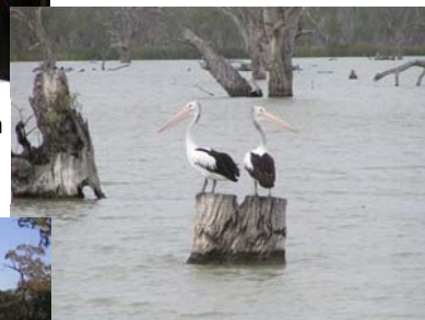
pelicans gather every day to fish