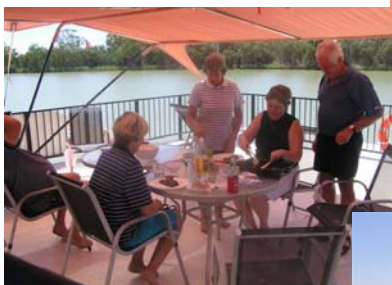
Lunch and a few drinks before our nanna nap